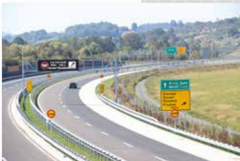
A detail of Banja Luka – Doboј motorway